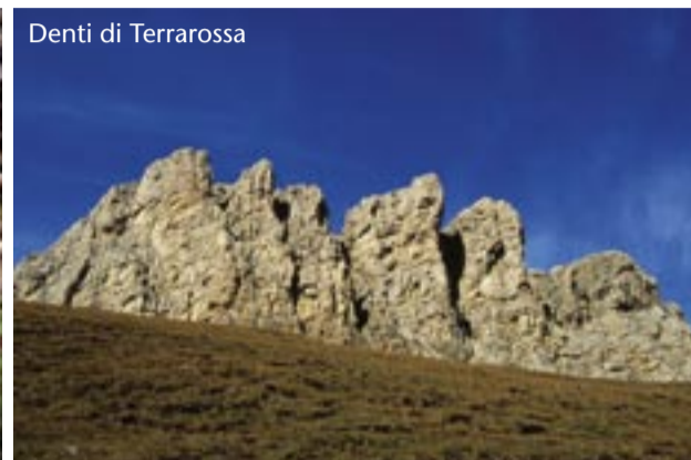
Denti di Terrarossa