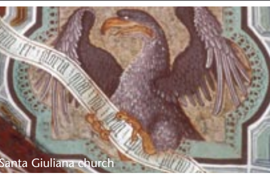
Santa Giuliana church