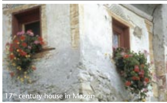
17th century house in Mazzin