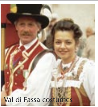
Val di Fassa costumes